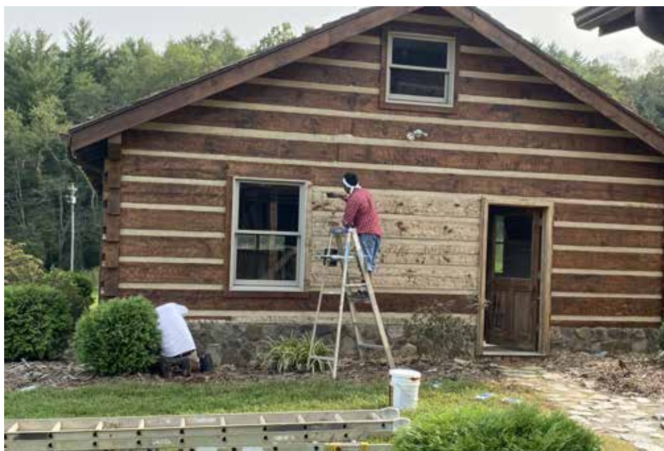
LEFT Continuation of the 15 year old, hand hewn chick siding building - ZAR Platinum Pro in Butternut.

The choice of stain/finish color contributes to the overall aesthetic appeal of any log or timber home. Each option conveys a look and feel that is reflective of the homeowner's taste and complementary of the overall appear-